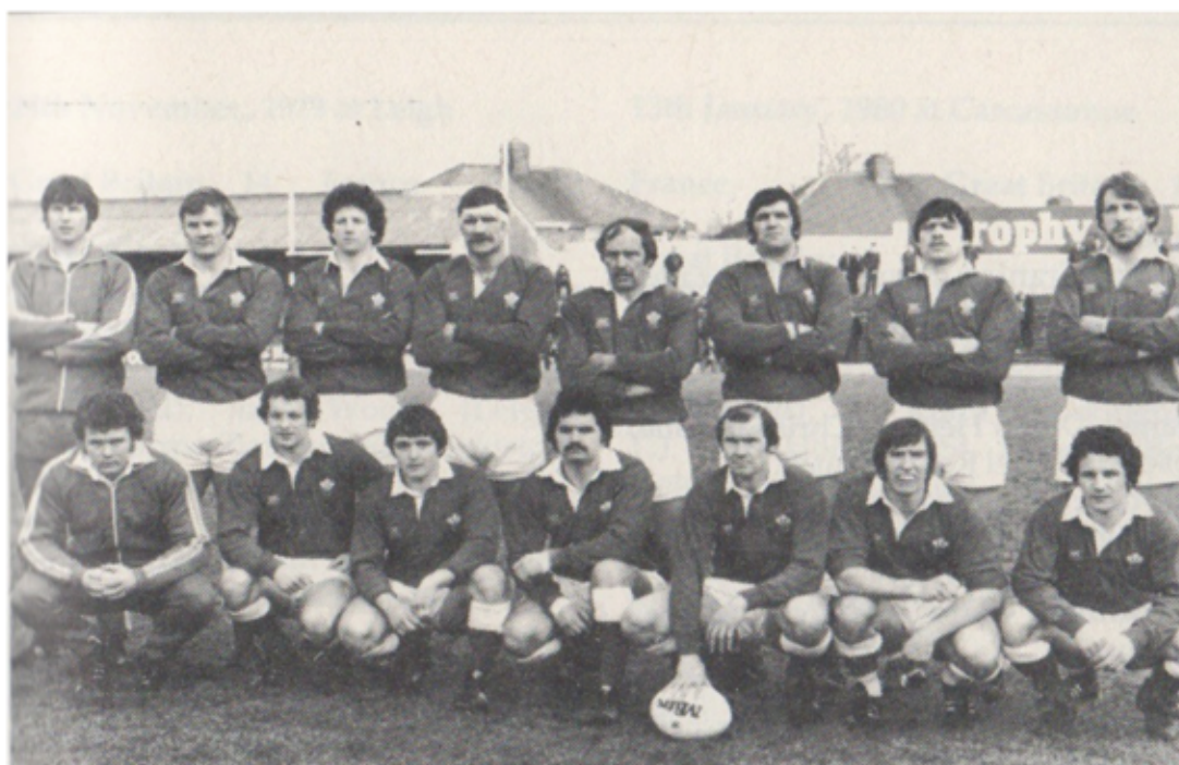
Welsh team, v France at Widnes in 1980