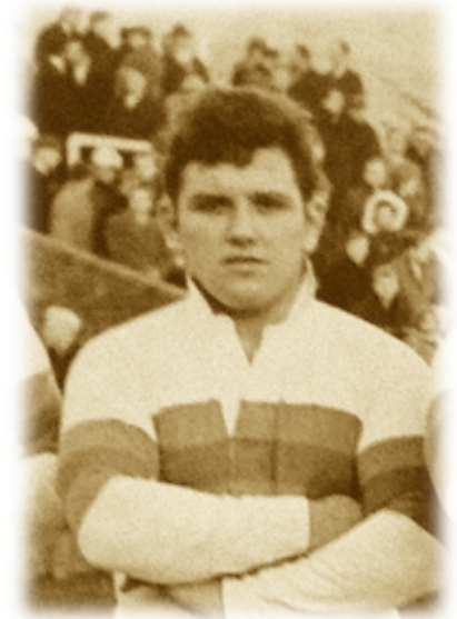
Trinity Playing Record